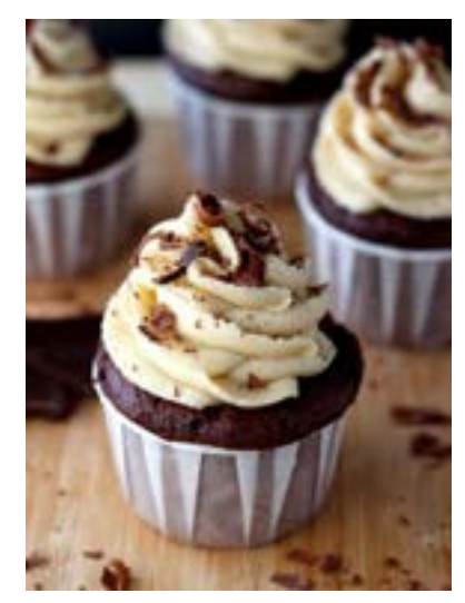
CUP CAKES $36 per dozen

Salted Caramel Mocha Chocolate Peanut Butter Caramel Rocky Road Chocolate Marshmallow Chocolate Guinness Stout