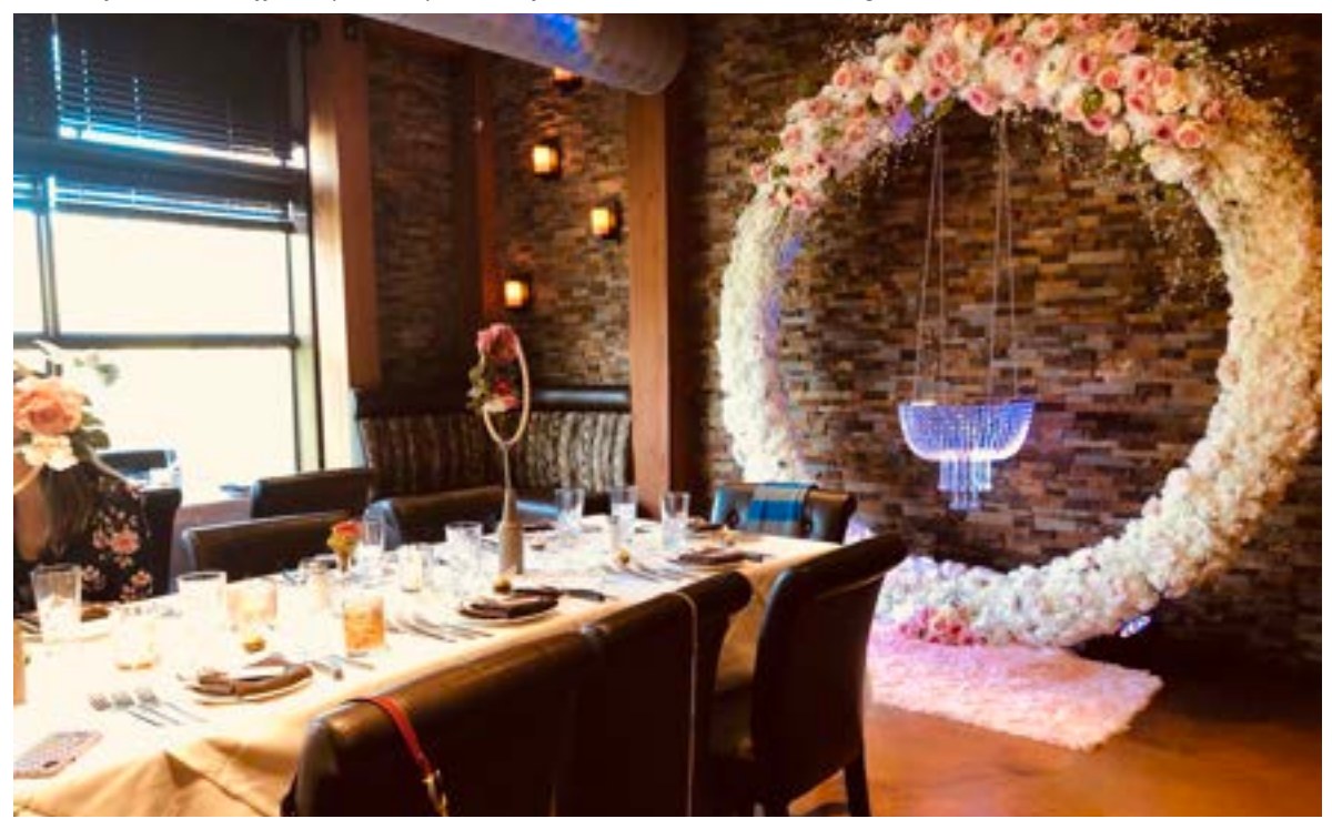
MAIN DINING ROOM 90 guests for a seated meal, 125 cocktail party

Natural light and open space during the day. Walls of candle-lit stacked stone, cozy tables, leather chairs and, of course, a book-lined wall help to create the warm, authentic ambiance in the Library. Floor-to-ceiling windows on one side of the room offer a picturesque view of downtown Towaco and Waughaw Mountain.