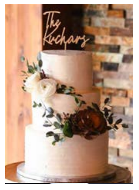
A classic rustic cake with no or lightly frosted & decorated with fresh flowers and a topper - provided by the party host.