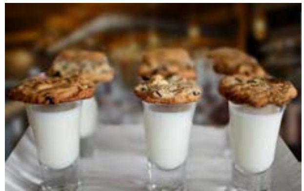
CHOCOLATE CHIP COOKIES & MILK SHOOTERS

$36 per dozen Served with Chocolate Milk and Whole Milk